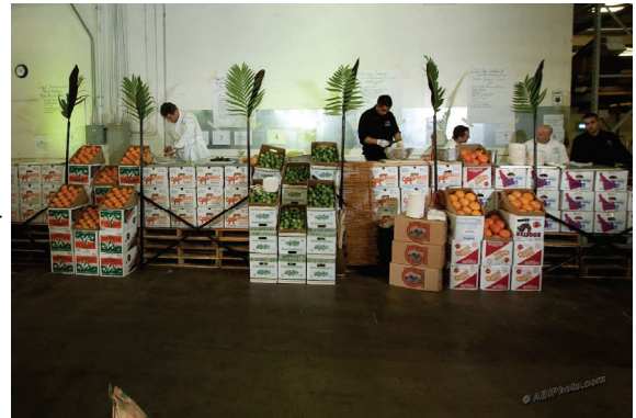
Top Chef competition at the San Diego chapter program