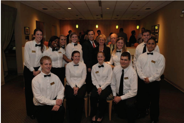
NACE student members from Widener University along with NACE members at recent chapter program.