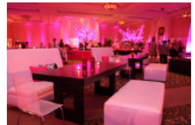
Event décor provided by sponsors.

Event attendees at the 3 rd Annual Taste of NACE Catering for the Cure® experienced all that the Orlando Chapter of the National Association of Catering Executive (NACE) has to offer on Tuesday, August 25 th at the Buena Vista Palace Hotel and Spa. Like no other industry event, the 3 rd Annual Taste of NACE Catering for the Cure® offered guests an opportunity to raise funds and awareness for Susan G. Komen for the Cure® Central Florida, while partying the night away.